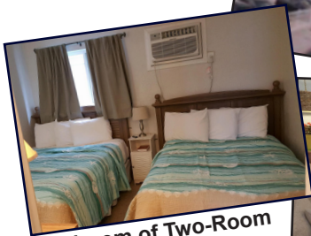
Bedroom of Two-Room Efficiency Suite