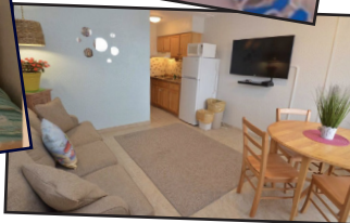
Two-Room Efficiency Suite