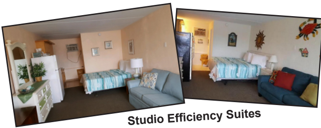
Studio Efficiency Suites